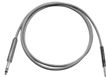
Longframe to Bantam Conversion Cord